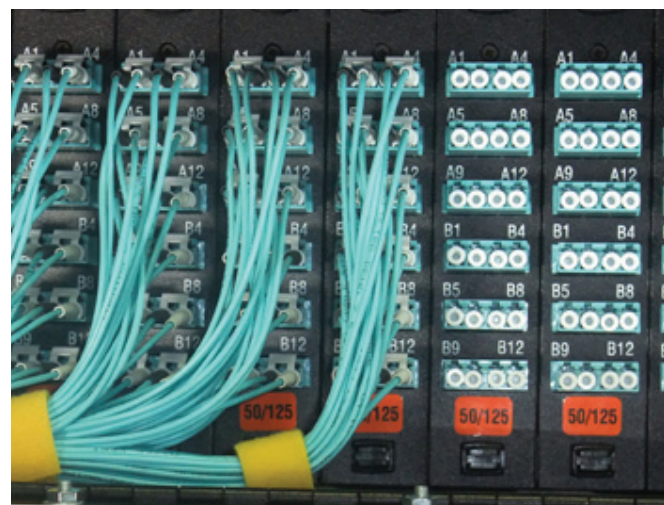
24 fiber MM LC adapter plates installed in a 4U patch panel.