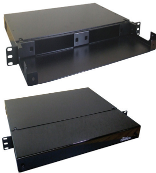
1U Rack Mount Enclosed Housing

The panels are fabricated from sheet steel (4U) or powder coated aluminum (1U and 2U).